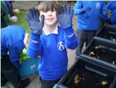
Harlequin Class have been looking at ways to improve their environment and have planted bulbs ready for spring.