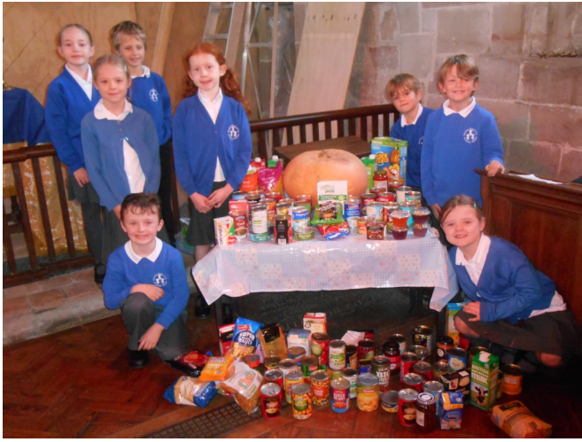
King Eider Class show off our food collection for the Tamworth Food bank.